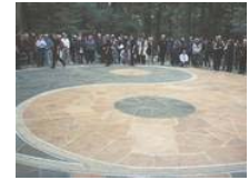
A crowd gathers around the new Tai Chi court at Cabin John Regional Park.

The Tai Chi Court is located at Cabin John Regional Park on 7400 Tuckerman Lane in Bethesda. For more information, visit www.wuweitaichi.com .